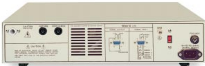
HypotPLUS® II includes rear panel high voltage and return connections and remote control connections to make it easier to build into a rack mount system.