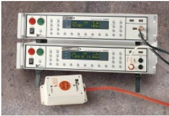
HypotPLUS® II shown with HYAMP® II and interconnecting receptacle box for testing products terminated in a line cord. Also shown are the standard rack mount handles.