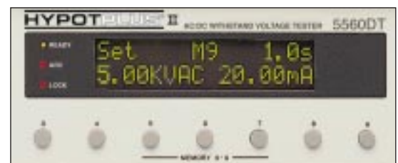
High resolution LCD clearly indicates setup parameters and test results. Single function dedicated keys speed setup without scrolling through the menu.