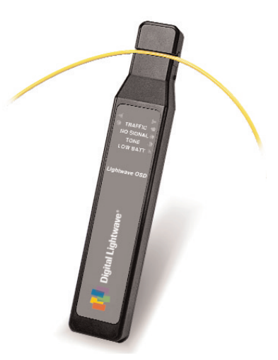
Lightwave OSD (LW OSD)

When testing coated fibers, the slim design of the LW OSD allows easier access on a splice tray, where workspace is limited. The clamping trigger is ergonomically designed to fit the natural motion of the operator's hand.