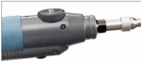
Magnification and focus controls

Thanks to EXFO's FIP-400 Fiber Inspection Probe, checking connectors and other fiber terminations for polish quality and cleanliness has never been easier. Benefit from the best optical resolution in the industry and see scratches and dirt particles as small as 1 \mu\text{m} .