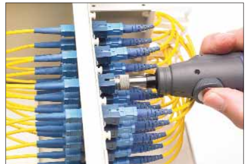
Patch panel bulkhead inspection