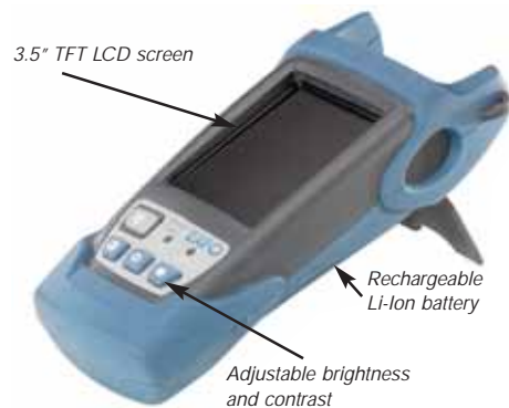
3.5" TFT LCD screen