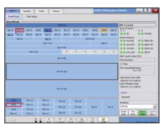
FTB-8120NGE/8130NGE SmartMode: multichannel signal discovery with real-time alarm scan (shown in the FTB-400 user interface).

SmartMode automatically discovers the signal structure of the OC-n/STM-n line including mixed mappings and virtual concatenation (VCAT) members. In addition to this in-depth multichannel visibility, SmartMode performs real-time monitoring of all discovered high-order paths and user-selected low-order paths simultaneously, providing users with the industry's most powerful SONET/SDH/OTN multichannel monitoring and troubleshooting solution. Real-time monitoring allows users to easily isolate network faults, saving valuable time and minimizing service disruption. SmartMode also provides one-touch test case start, allowing users to quickly configure a desired test path and SmartMode specific reporting.