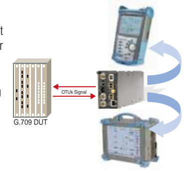
Power Blazer modules support G.709 testing in either the FTB-200 Compact Platform or the FTB-400 Universal Test System.