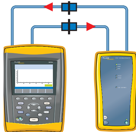
OptiFiber Main Unit