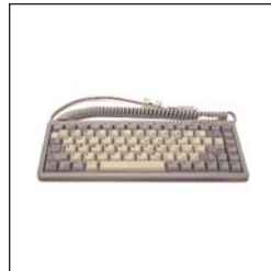
507 - PS/2 Keyboard (US Layout)