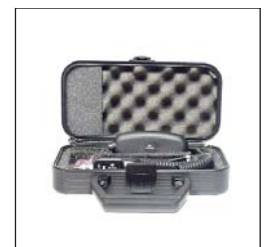
546/547 - USB Visual Inspection Probe with case