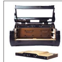
513 - AC Power Module (Module Only)