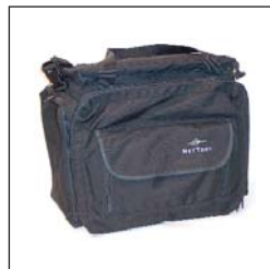
522 - Soft Bag