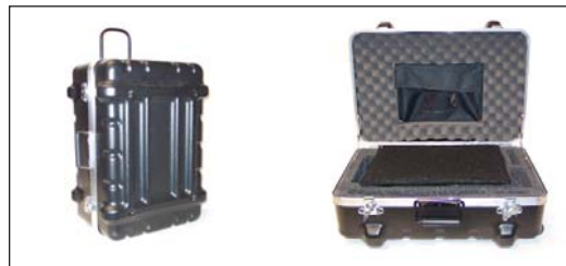
520 - SBA Hard Transit Case