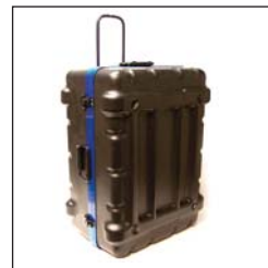
524 Deluxe Hard Case (case only)