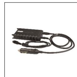
4500-AUTO - Cigarette lighter charger for SBA and MBA (DC only)