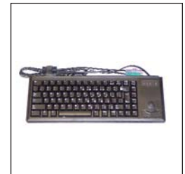
506 - PS/2 Keyboard with Trackball (US Layout)