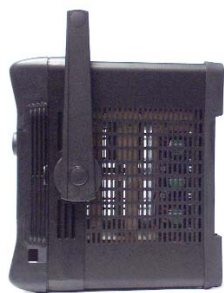
Large Bay Adapter (LBA)