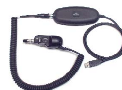
545 - USB Video Inspection Probe