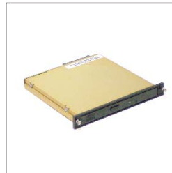
501 - CD/RW Drive