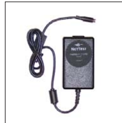
511 - AC charger/adaptor