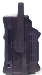
Mid Bay Adapter (MBA)