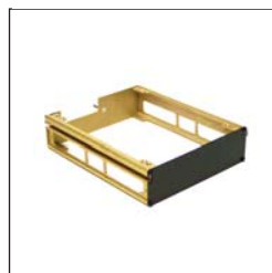
530 - Single Slot Filler Module