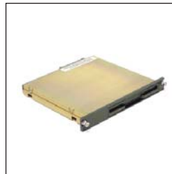
502 - Floppy Drive