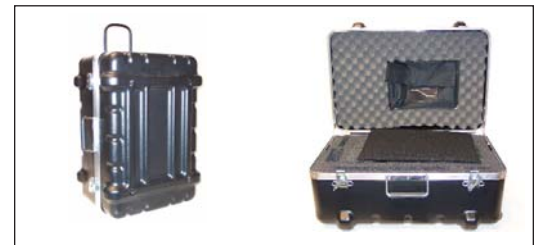
521 - MBA Hard Transit Case