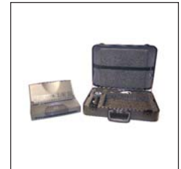
515 - Portable External Printer