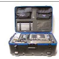
55X - Test Fiber Module