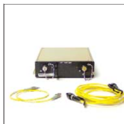
520 - ORL Module