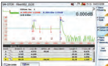
Trace and Table displayed simultaneously