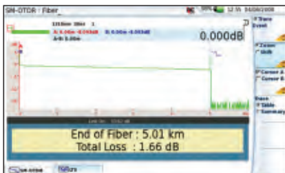
Precise Fault Location

With its dual wavelength capability and the advanced features of the embedded software, the LM OTDR Module lets technicians quickly obtain an overview of possible macro-bend locations. This capability helps ensure higher quality of service and facilitates troubleshooting operations.