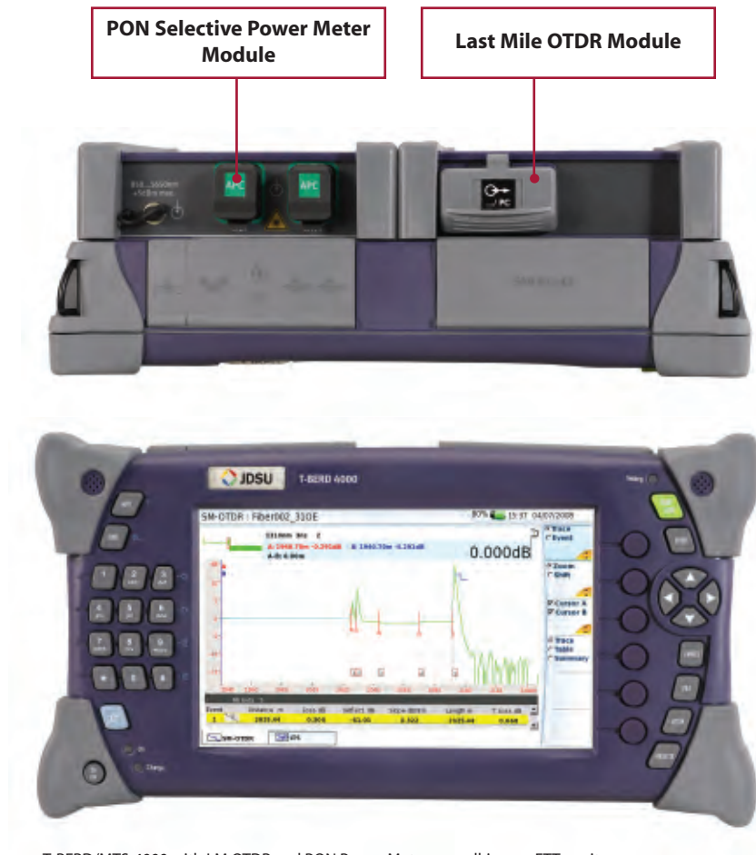
T-BERD/MTS-4000 with LM OTDR and PON Power Meter—an all-in-one FTTx unit