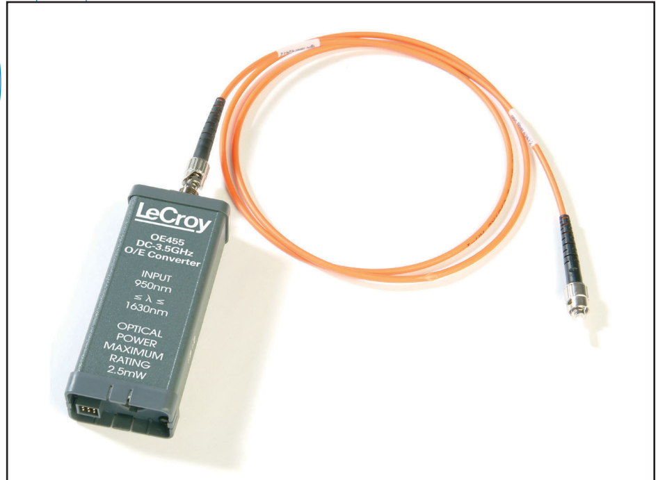
OE455 optical-to-electrical converter shown with multi-mode fiber jumper attached.

These wide-band multi-mode optical-to-electrical converters are designed for measuring optical communications signals. Their broad wavelength range and multi-mode input optics make these devices ideal for applications including Gigabit Ethernet and Fibrechannel, as well as SONET/SDH up to 2.5 Gb/s.