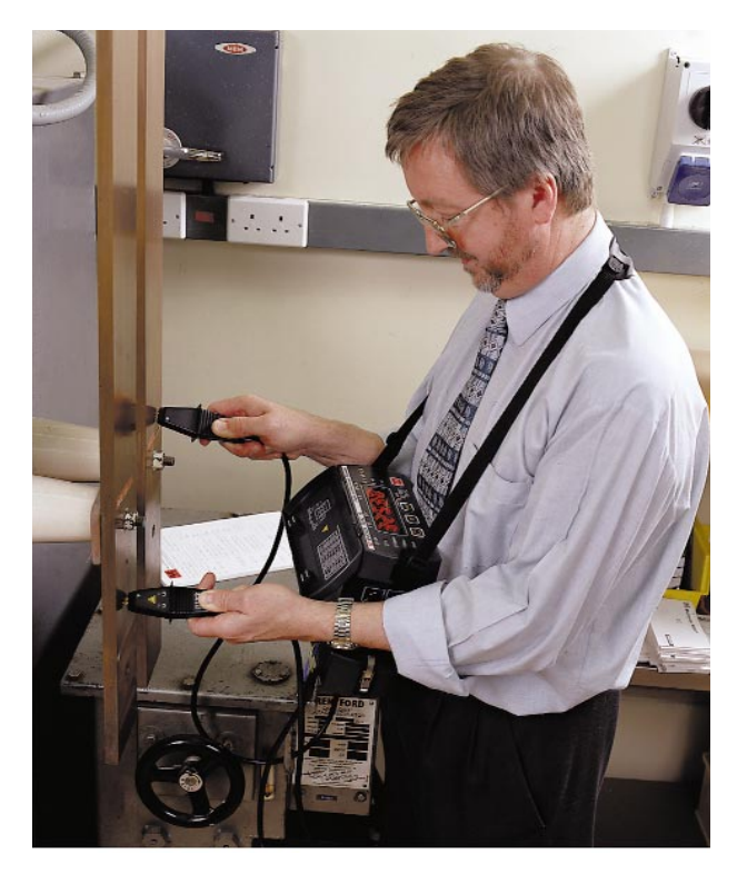
The DLROs are light enough to be worn around the neck. They are also small enough to be taken into areas which were previously too cramped for easy testing.