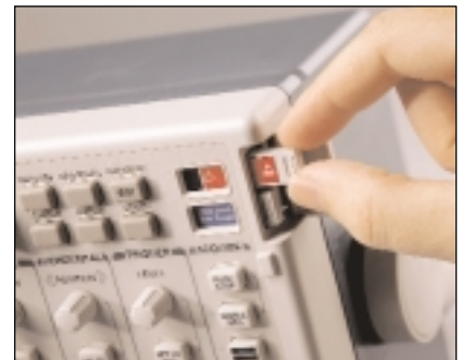
Application Module being installed.