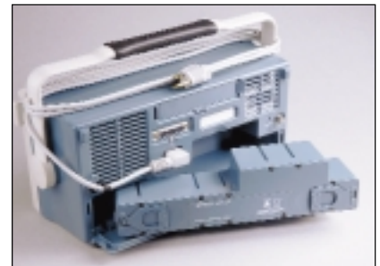
TDS 3BAT – Battery Pack being installed.

Converts ITU-R BT.601 format serial digital video to analog video. Automatically detects and displays 525/60 and 625/50 formats. Provides composite and component (RGB, YPbPr, or YC) outputs. Provides auto equalization for cable lengths up to 250 m and EDH and counting for incoming SDI signal. Adds video picture mode with on-screen line select and vectorscope mode with 100% and 75% color bars. Adds triggering and vectorscope graticules for analog HDTV. Includes full functionality of TDS 3VID Extended Video Applications module. Includes special output cable and four 75 \Omega terminators. Ships with Quick Reference and User Manuals in 10 languages. (Russian not available.)