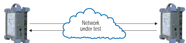
■ Dual-test-set configuration (arrows show direction of traffic).

This tool lists all client-configured routers identified between the local and the destination IP address, within a given delay. When link routers respond to the ping command, the route and statistics are collected by the local module from these replies. Results collected include the IP address of routers in the link and the response delay, round-trip time measurement and a count of frames sent and received. The user also has the ability to configure the parameters of the trace route.