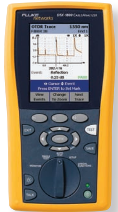
DTX Compact OTDR