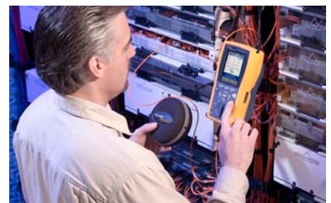
DIX with OTDR module attached and launch fiber