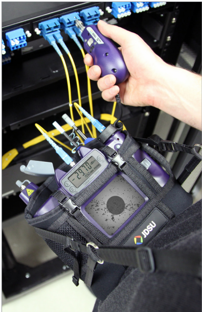
HP2-60-P4 shown with utility carrier and other tools.

The HP2 system, derived from the popular HD2 Series, provides high-quality image resolution in a compact, portable design. The integrated power meter offers quick, easy, and convenient field measurement of optical power and attenuation. Easy push-button operation makes the device simple and straightforward, while the inspect-test process establishes optimal workflow practices.