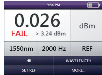
Accurate measurement and simple operation Make quick, easy dual-wavelength measurements at 850 and 1300 nm or 1310 and 1550 nm using saved reference levels.