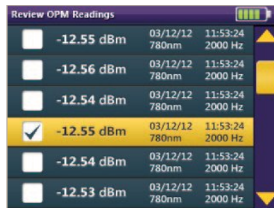
Store inspection and measurement readings on the device Store up to 10,000 measurement results on the device for export to PC.