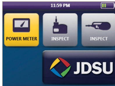
Intuitive smartphone-style user interface High-contrast, color touch screen with menu icons