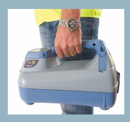
POWER MANAGEMENT The operator can control transmitter

Three models, capable of delivering 1, 5 or 10 Watts (true output) with multiple features for a broad range