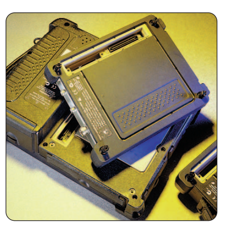
Y350C platform combined with test modules

The Tektronix NetTek Y350C platform includes the display, power supply, CPU and battery compartments. Measurement modules can then be attached to the back. Up to four modules can be attached at once. A variety of modules and options allows you to tailor the instrument to service the standards and interfaces in use in your network.