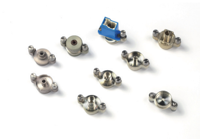
Optical adapters (BN 1014) for power meter output