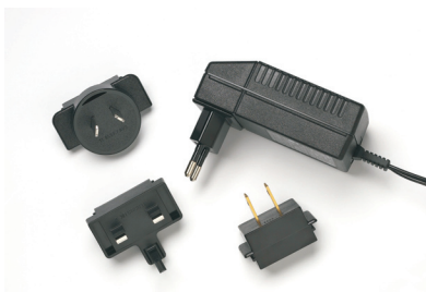
Worldwide compatible AC adapter/charger (SNT-121A)

Additionally, the OLT-55 can be used as a stand-alone power meter or laser source with all features of the corresponding OLS-55 and OLP-55.