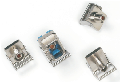
Optical adapters (BN 2150) for laser source output