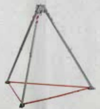
2.50m with webbing strap