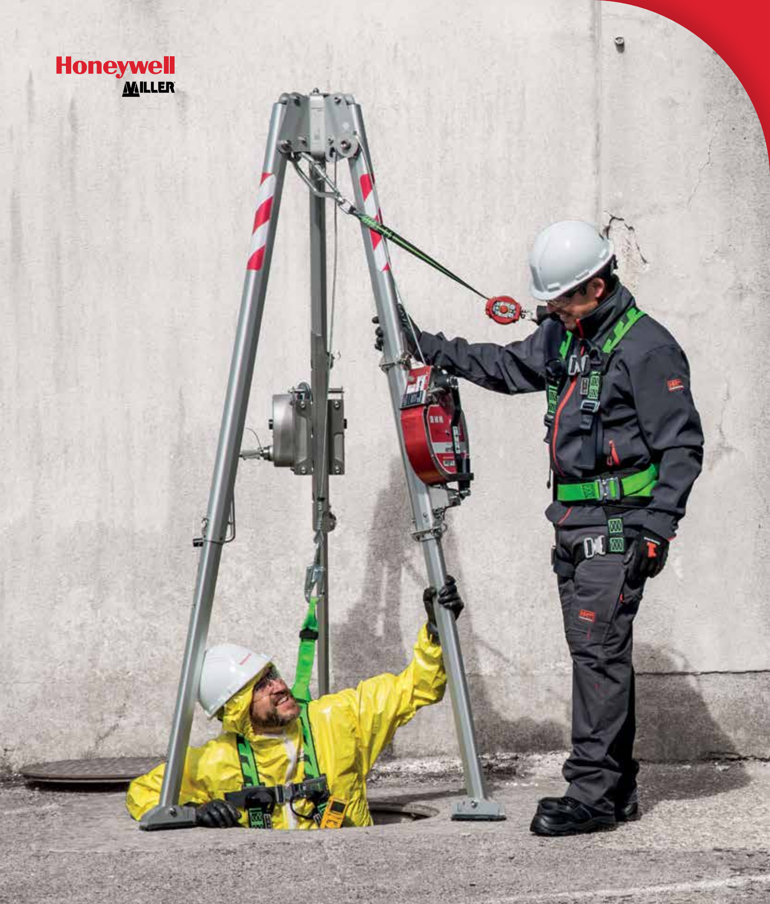
Honeywell Miller new Durahoist 3Pod for confined spaces