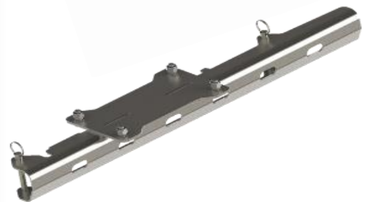
Bracket for the 3POD Tripod System (1034613)