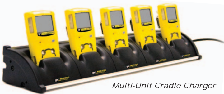
Multi-Unit Cradle Charger