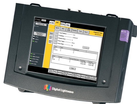
Network Information Computer (NIC GigE)

The NIC GigE is easy to use, with intuitive touch-sensitive GUI capabilities that allow technicians of any experience level to operate the unit. The NIC GigE is also fully interoperable with the entire NIC product line, providing a broad range of diagnostic capabilities.