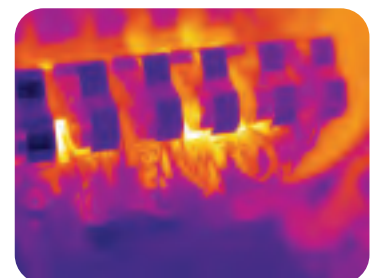
Infrared can accurately and quickly locate faults before failures, shutdowns, or even fires occur.