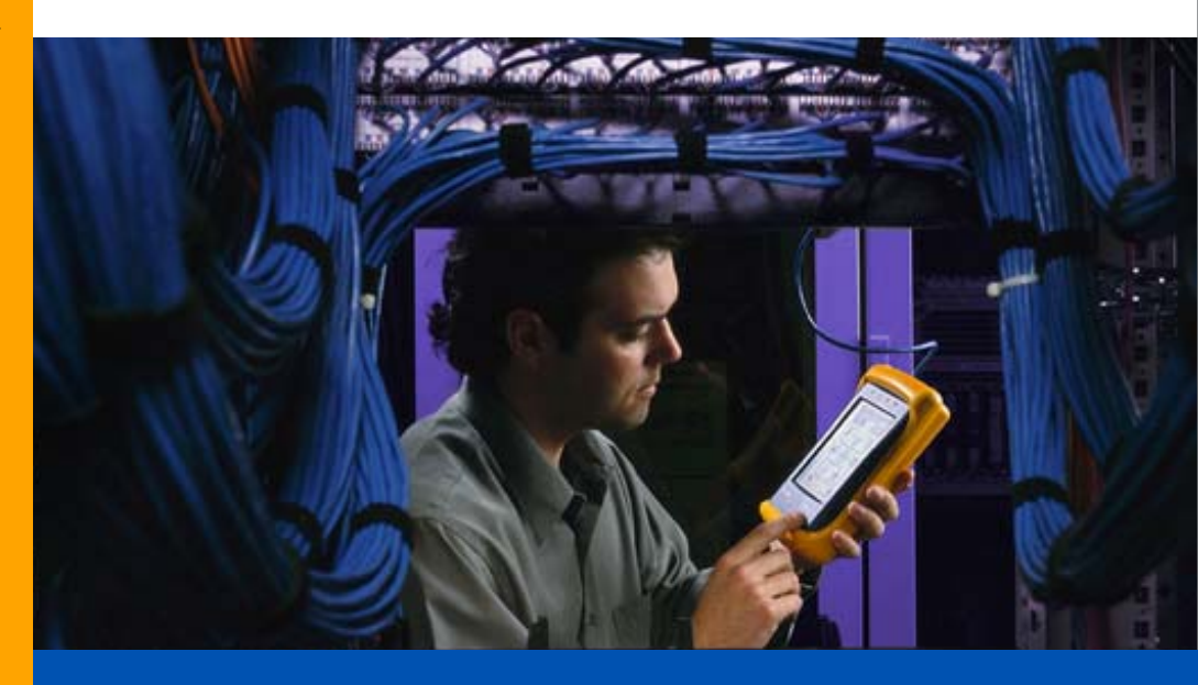
One touch view of all network components – even switches