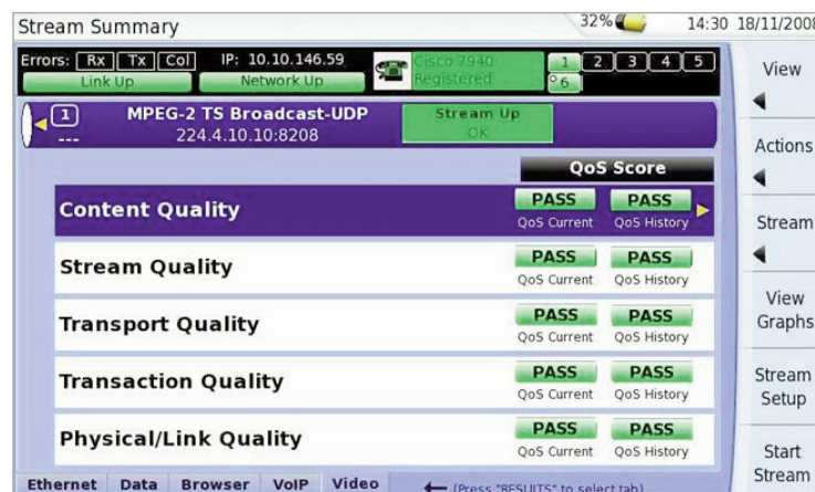
Figure 5: Example of IPTV Summary test screen