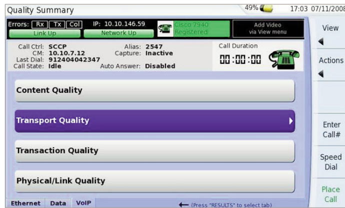
Figure 6: VoIP test interface

Technicians can use the T-BERD/MTS-4000 to turn up and troubleshoot voice service (voice over IP [VoIP]) connectivity, feature availability, and voice quality. They can also conduct IP ping, packet statistic, and trace route analysis to identify, diagnose, and sectionalize VoIP network and equipment problems.