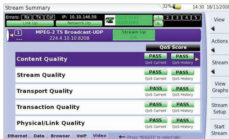
Figure 2: Example of Video test results using the T-BERD/MTS-4000 GUI with the JDSU Quality Layer Model