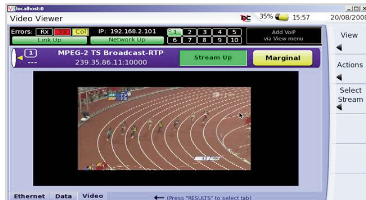
Figure 4: Example of IPTV Video Stream test

The T-BERD/MTS-4000 enables analysis of the video service (IPTV) stream anywhere in the Access network using a DSL or Ethernet interface. With its advanced performance monitoring features, the T-BERD/MTS-4000 accurately measures video QoS and QoE using built-in tests for content, transport, transaction, and physical link quality.