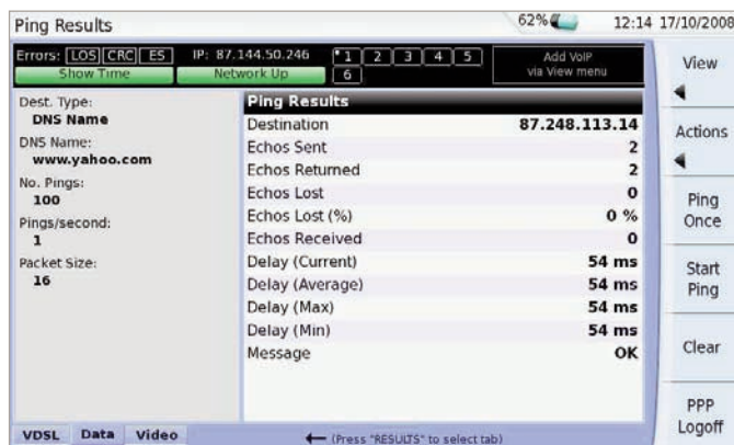
Figure 7: IP Ping test interface

The T-BERD/MTS-4000 enables Internet connectivity testing using an integrated Web browser and also performs required IP data tests (such as IP ping delay) to verify bandwidth requirements for real-time applications and services (such as online gaming and streaming video).