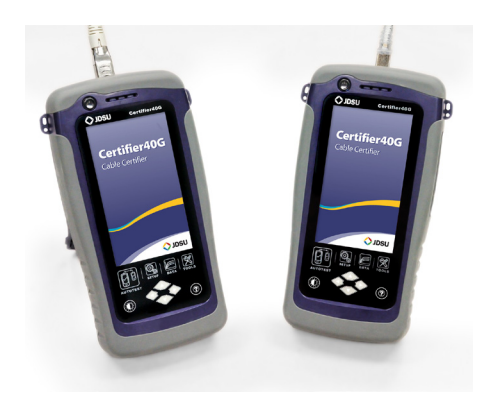
Two complete units to minimize time spent initiating, naming, and saving results

*Please specify regional cables: North America (NA) Type A, European (EU) Type C, United Kingdom (UK) Type G, Australian (AU) Type I.