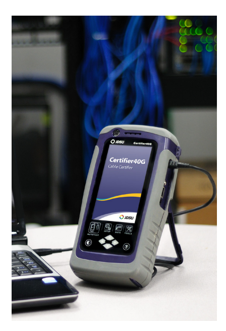
Complete PC desk reporting software