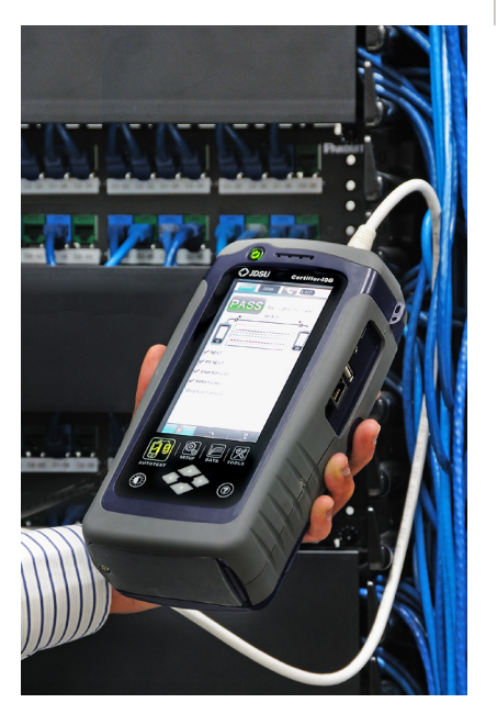
Superb ease of use with large graphical touch screen