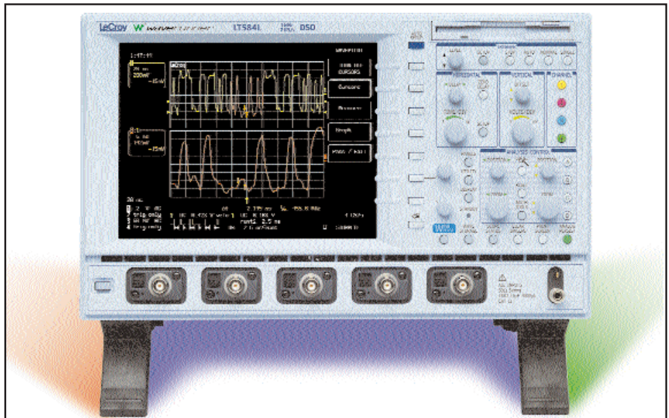
The LT584 model Waverunner-2 scope provides excellent data acquisition characteristics and terrific value.

The LT584 is the new flagship of the Waverunner-2 series of digital oscilloscopes. It harnesses the power of 1 GHz bandwidth, and gives users remarkable cost savings and convenience. With today's extreme time-to-market pressures, engineers need to evaluate signals quickly and accurately. The Waverunner-2 series accomplishes these critical tasks, and does so at appealing prices. LeCroy's Waverunner-2 reputation has been built largely upon its intuitive front panel operation which saves engineers time in analysis and problem solving.