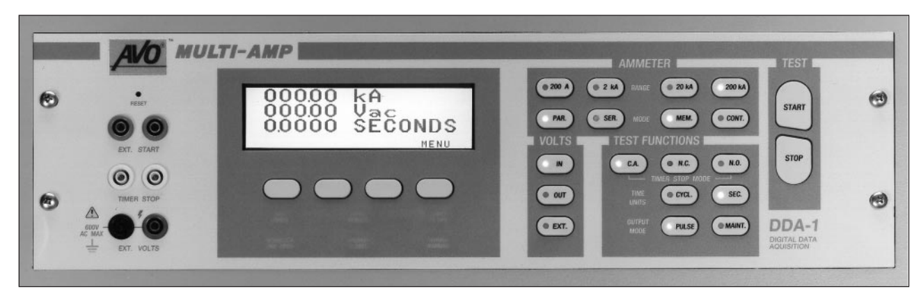
Model DDA-1600 uses the Model DDA-1 Digital Data Acquisition Instrumentation and Control System. This system offers the latest in digital signal processing technology to control the test set and measure reactions of the breaker under test.

Zero dc offset: Use of digitally controlled SCRs instead of a contactor to initiate the output of the test set eliminates closing-time error and ensures precise initiation at of the output current waveform every time.