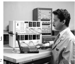
PULSAR performs computerized tests with IBM, or compatible PCs, even notebooks.

PULSAR can be operated manually by simple, front-panel controls or combined with any IBM® or compatible PC and the Megger AVTS™ software package for automated steady-state, dynamic and transient testing.