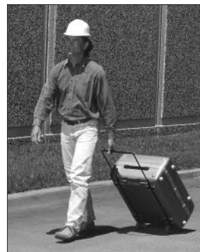
The laboratory-style unit comes with a retracting-wheel carrying case for easy transport.