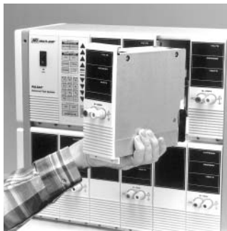
Modules slide out easily so you can configure the system to meet your applications.

The system is customized by adding a timer module and the number of current and voltage amplifier modules needed for specific testing applications.