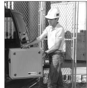
One technician can easily carry PULSAR.