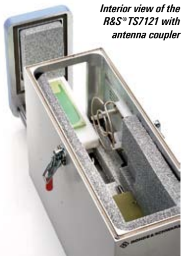
Interior view of the R&S®TS7121 with antenna coupler

The lower compartment of the base accommodates the guide rails and, in the case of the automatic versions, also the pneumatic system including the pressure regulators and valves. The valves and the feedback sensors are controlled via a 24 V connector.