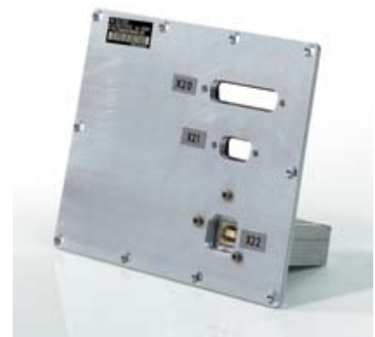
R&S® TS-F23FU2 exchangeable connector plate of the R&S® TS7123 with USB feedthrough

The R&S® TS7121 and R&S® TS7123 shielded RF test chambers are fully configured, so that you can, in conjunction with an antenna coupler, quickly implement a variety of applications in service, development, and series production. The long-standing experience of Rohde & Schwarz in the fields of RF technology and series production of equipment will be of major help in attaining your goal even faster.