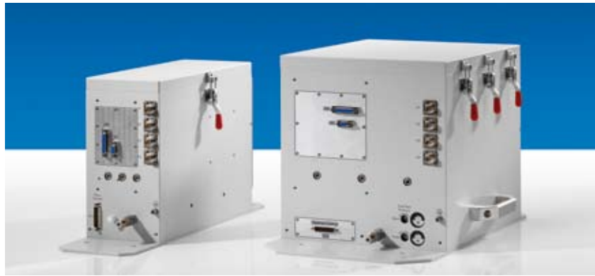
Rear view of the R&S®TS7121 and R&S®TS7123 with exchangeable connector plate and RF connectors

The actual RF chamber is located above the pneumatic chamber. On the RF chamber rear panel, four RF feedthroughs are provided for connecting antenna couplers or DUT RF interfaces. Customer-specific antenna couplers or antenna couplers from Rohde & Schwarz can be attached as required to the side panels or to the rear panel of the RF chamber.