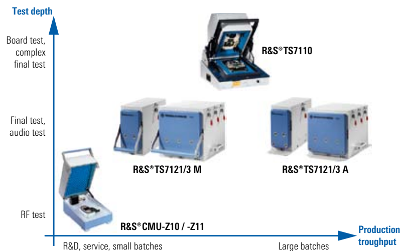
Product spectrum for various areas of application

The automatic and manual versions R&S®TS712xA and R&S®TS712xM of the RF test chambers have the same basic design, ensuring the same test functionality for both versions in development, production, and service.