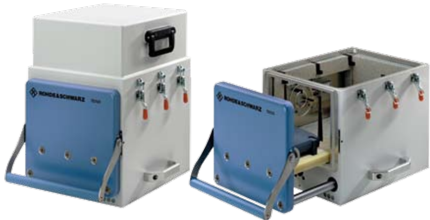
R&S® TS7123M with elevated cover and brackets for additional test equipment

The optional elevated covers provide sufficient room for the integration of further test equipment such as CCD cameras or keyboard stimulators above the DUT. For the integration of additional test equipment, you can use the brackets on both sides of the RF test chambers.