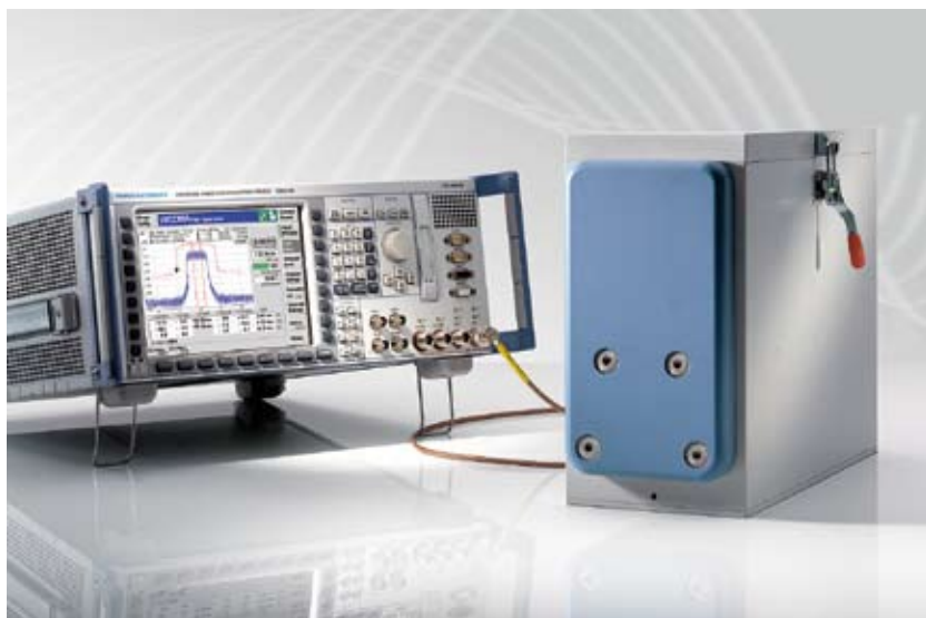
R&S®CMU200 radio communication tester with automatic R&S®TS7121A RF test chamber