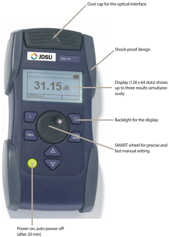
Dust cap for the optical interface