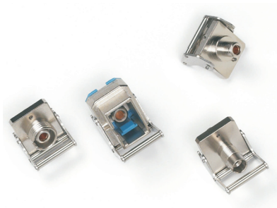
Optical adapters (BN 2150) for laser source output