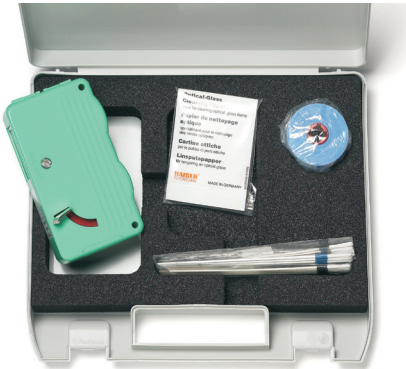
OCK-10 Optical Connector Cleaning Kit (accessory)