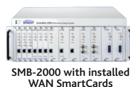
SMB-2000 with installed WAN SmartCards

SmartBits Division 26750 Agoura Road Calabasas, CA 91302 USA Tel: 818-676-2300 Fax: 818-676-2700 Toll Free: 800-927-2660 www.spirent.com