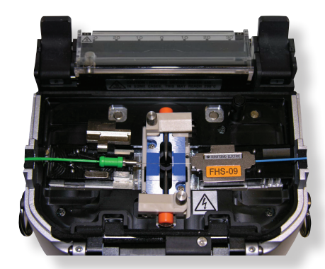
Shown with Optional Lynx—CustomFit™ Splice-on Connector.