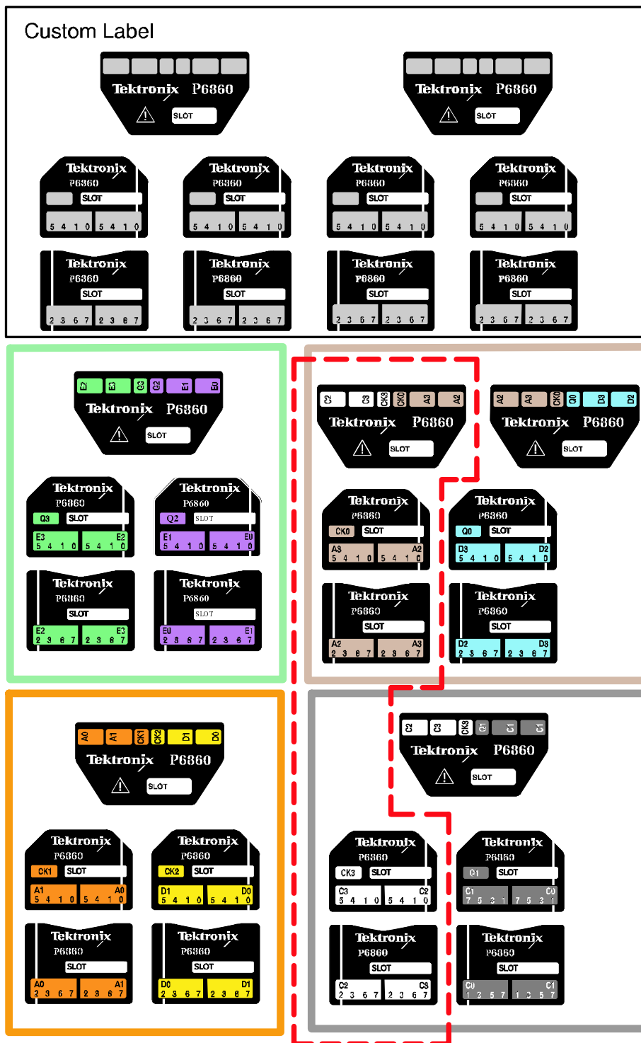
Figure 1: Example of sheet of P6860 probe labels