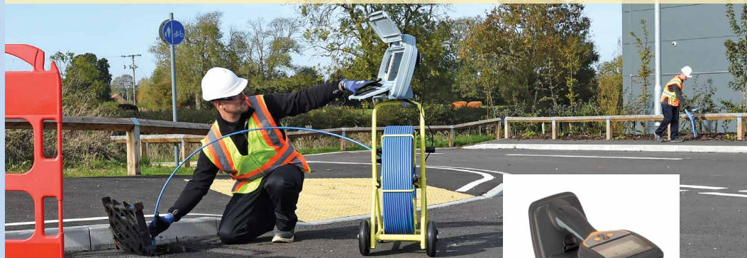
P541 Plumbers Reel