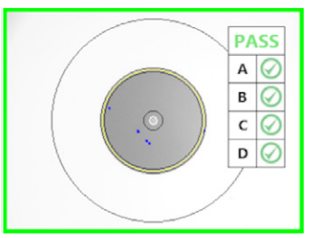
The OLTS-85 gives you the answer: