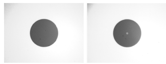
Which of these connectors meets the IEC spec?