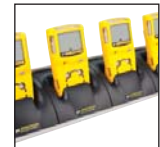
Five unit cradle charger

For a complete list of accessories, please contact BW Technologies by Honeywell.