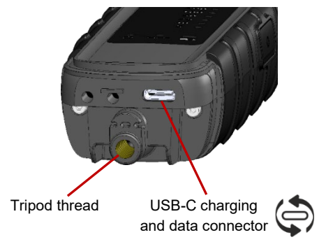
Fig. 2. View with cover open

The newly developed sensor test provides additional assurance. The correct function of each sensor is checked every time the RadMan 2 is switched on. The device does not need to be checked anymore with a test generator before starting work.