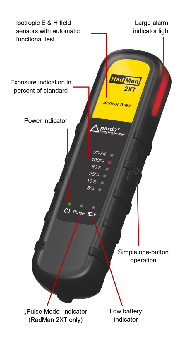
Fig. 1. Front view with controls and indicators

The actual field exposure level is indicated in six steps from 5% to 200% by LEDs. The percentages refer to the proportion of the power density limit value specified in a safety standard. If the field exposure level exceeds 50% of the limit value, the device vibrates and emits a loud alarm tone. There is also a bright light in the top part of the RadMan 2 that can be easily seen from various angles. The light flashes red in time with the alarm signal. A second, more persistent alarm sounds when the 100% threshold is exceeded, warning the user to leave the danger area. Device versions with alarm thresholds that can be set using PC software are also available.