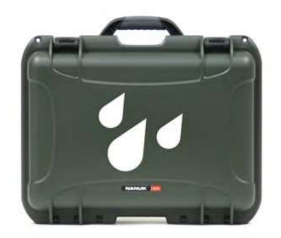
IPX7INGRESS PROTECTION WATERPROOF

Tested by an independent laboratory to verify compliance with the following standards: