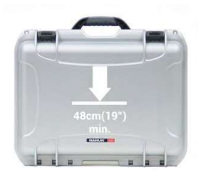
ASTM D-4169 DC-18 DROP TEST