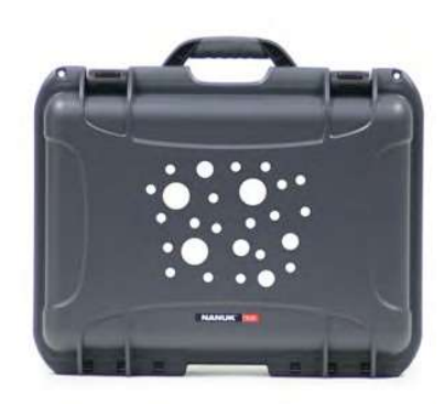
IP6XINGRESS PROTECTION DUSTPROOF