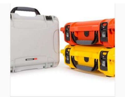
Up to 10 Colors From Emergency Orange to Olive Drab.

Heavy impact, repetitive shock, extreme vibration, and all kinds of weather are no match.