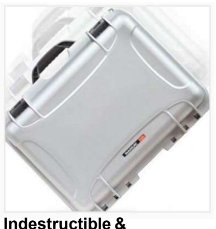
Lightweight NK-7 Resin bodies, rounded corners, thick walls.

IP67 Rated. Resists fatigue, deformation. Nothing gets in.