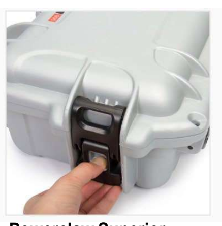
Powerclaw Superior Latching System Compressive force to clamp your case tight. Patented.