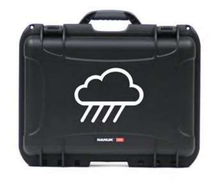
ASTM D4169 DC-18 RAINFALL