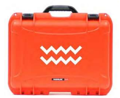
ASTM D4169 DC-18 VIBRATION