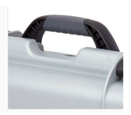
Soft Grip Handle Extreme durability and comfort.