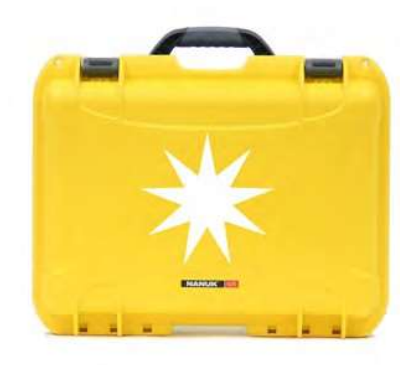
ATA SPECIFICATION 300 CATEGORY 1 IMPACT