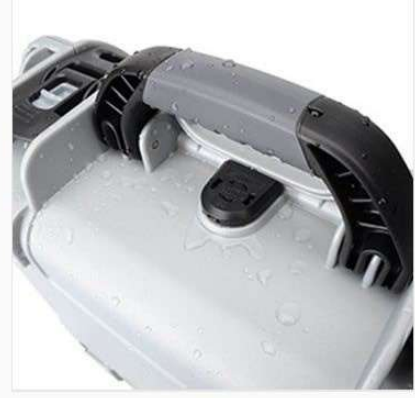
Waterproof & Dustproof

IP67 Rated. Resists fatigue, deformation. Nothing gets in.