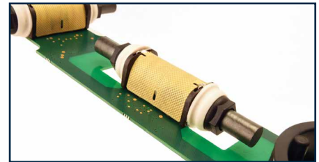
Accessory base tray

90V signal output and automatic impedance matching