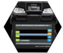
5 inch touch screen